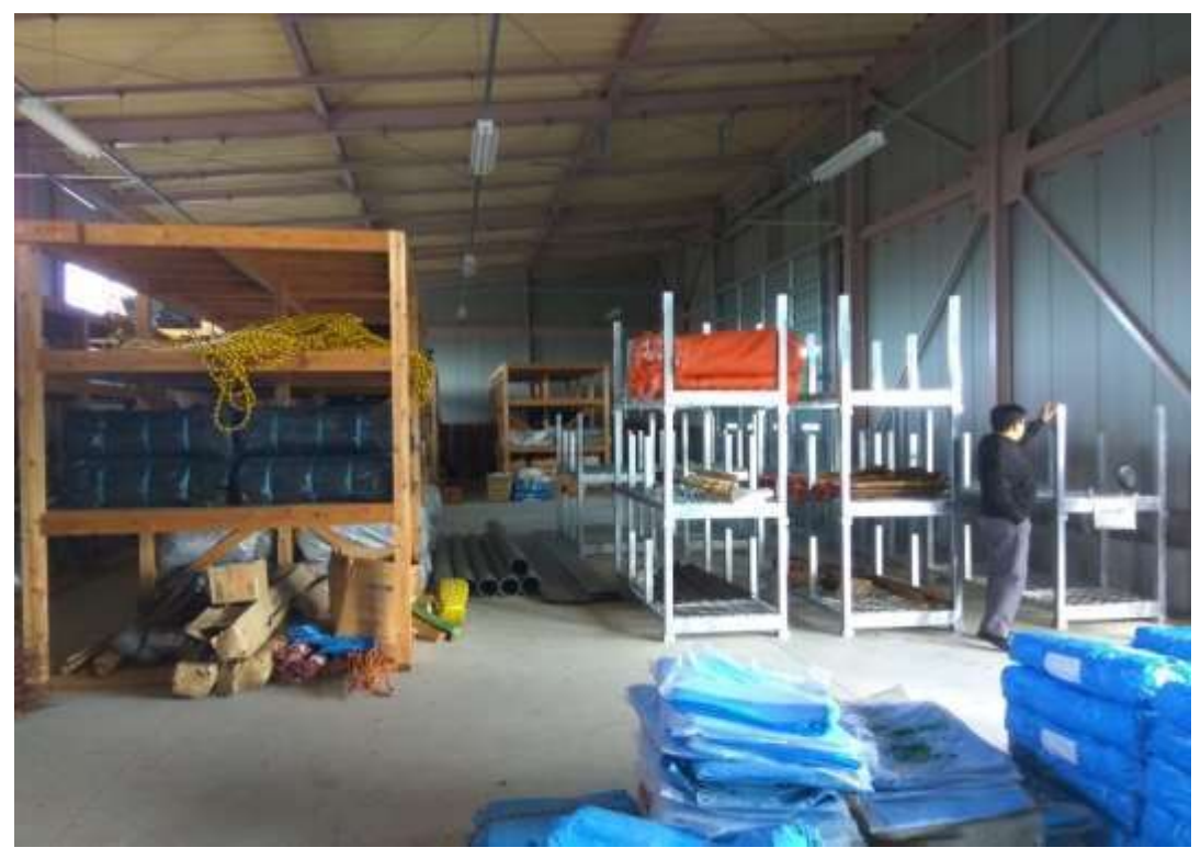
FLOOD MATERIAL STORAGE SITE AT OKAYAMA