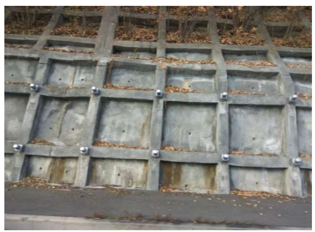
SOIL STABILIZATION WITH ANCHORING BOLT

A presentation on "Evaluation of the upstream water level of the submerged weir" was given by Prof.KesayoshiHadano.