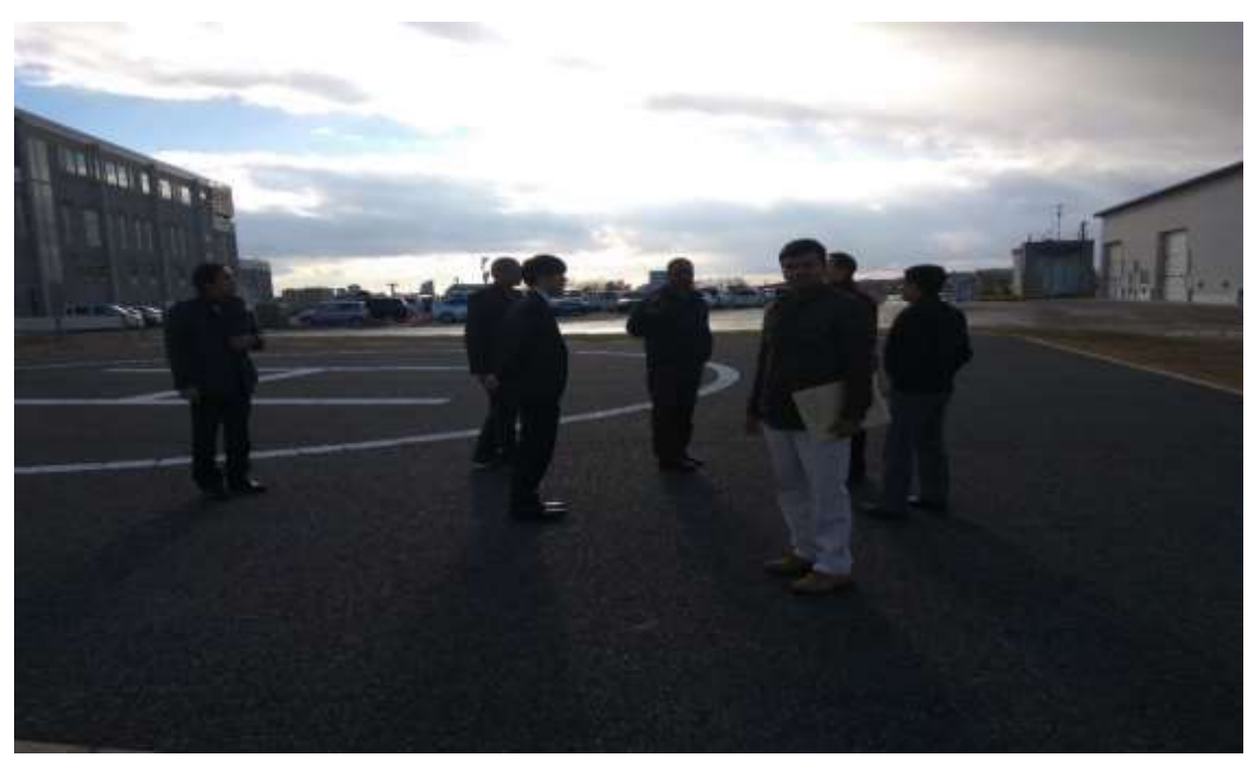
HELIPAD AT FLOOD MATERIAL STORAGE SITE