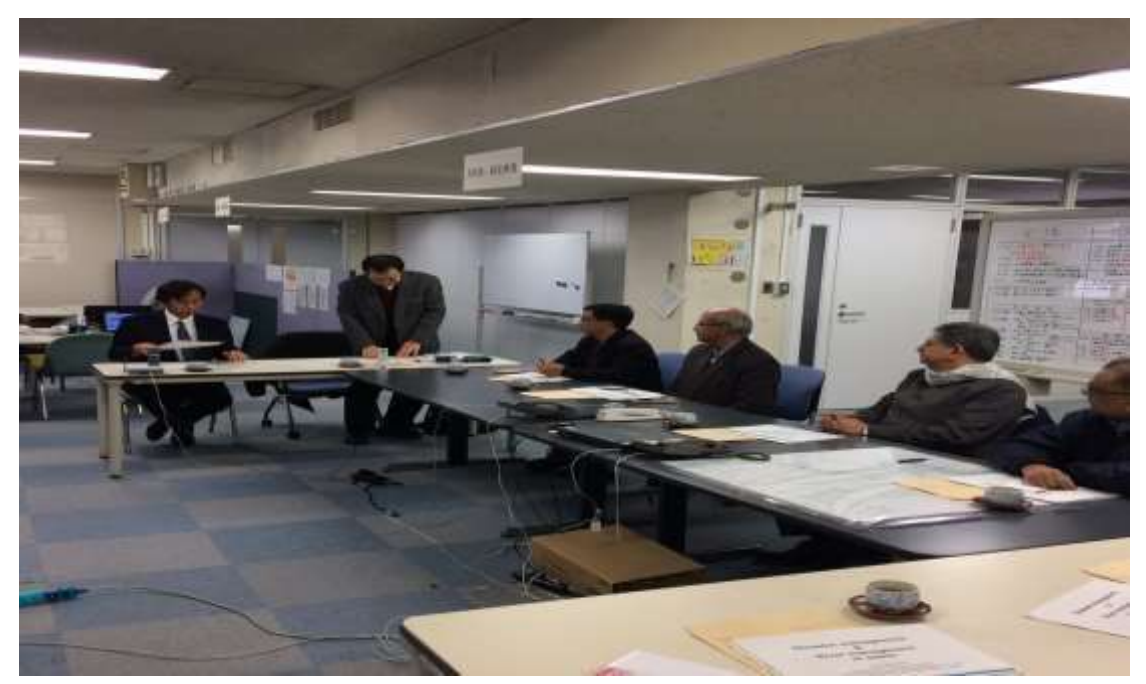
PRESENTATION AT OKAYAMA RIVER MANAGEMENT OFFICE (MLIT)ON DISASTER MANAGEMENT & RIVER MANAGEMENT