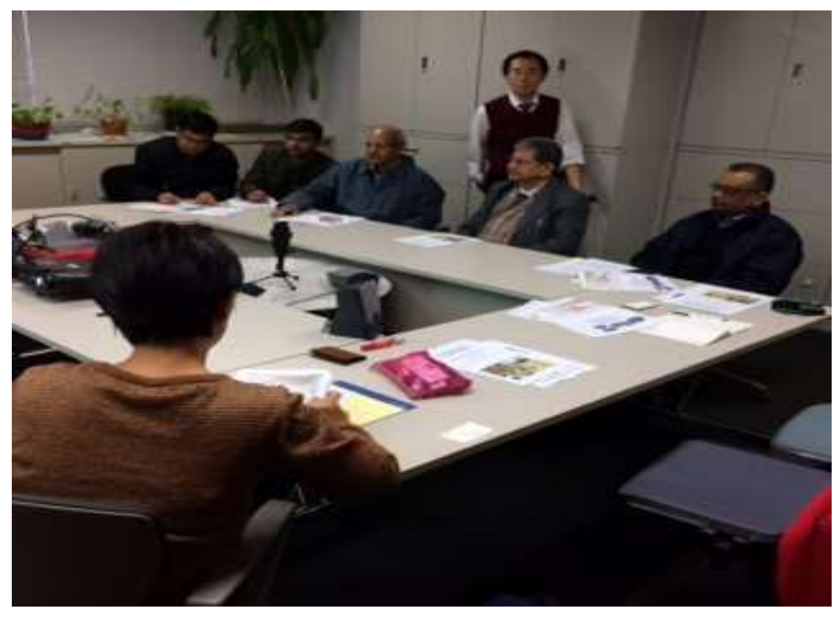
PRESENTATION ON CELL PHONE CALL DATA RECORDING (CDR) ANALYSIS FOR FLOOD RISK MANAGEMENTAT TOKYO UNIVERSITY, TOKYO, JAPAN

The proposed solution to the above mentioned problem is (i) Estimating people distribution/movement with data from cell phone CDR system to better monitoring and understanding behaviour and activity of people during flood (Call Detail Record data analysis) (ii) Deploying location-based warning system to people in possible affected area (SMS via operator). But have limitation of CDR as (i) Not all movements are recorded (ii) Representing only a part of total population (i.e. cell phone users) (iii) Anonymized (No demographic attributes) (iv) Data is too big (billions of record).